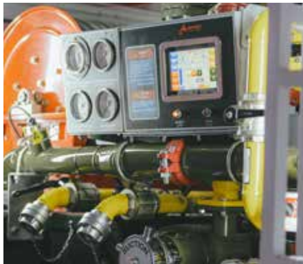
RESCUE AND RAPID INTERVENTION VEHICLE