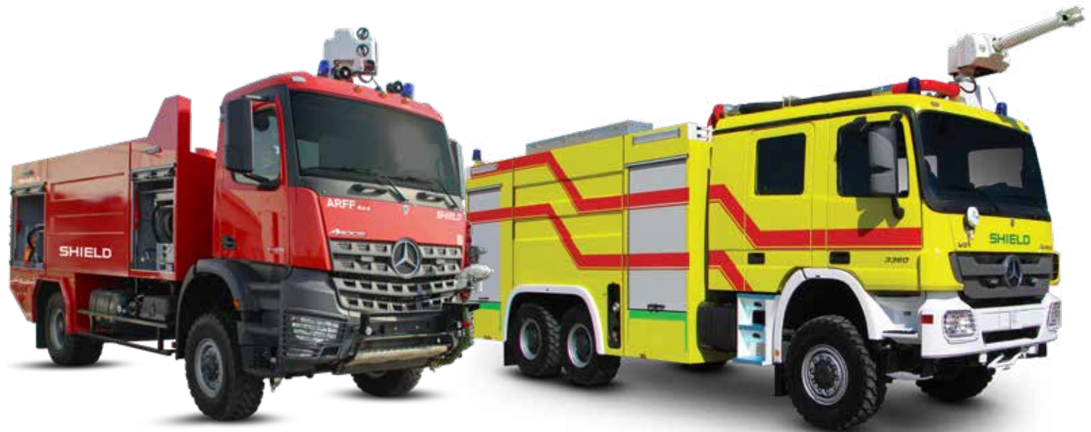
AIRPORT RESCUE & FIREFIGHTING VEHICLE ON COMMERCIAL CHASSIS